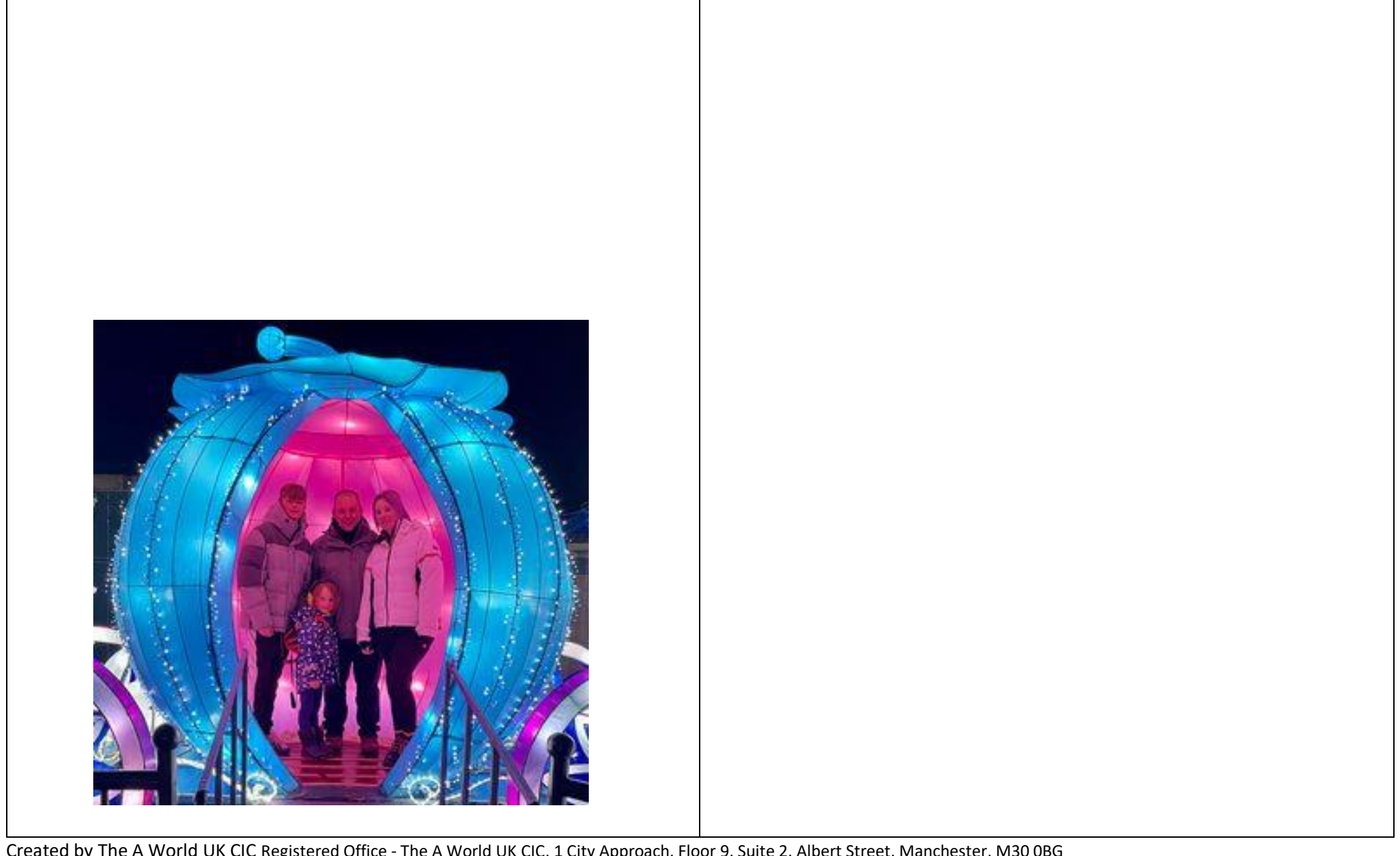
Created by The A World UK CIC Registered Office - The A World UK CIC, 1 City Approach, Floor 9, Suite 2, Albert Street, Manchester, M30 0BG Company registered in England. Registered number- 12341734